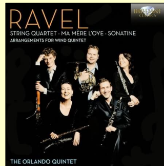
Ravel: Arrangements for Wind Quintet The Orlando Quintet Brilliant Classics