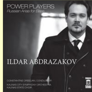
"Power Players," Russian Opera Arias Ildar Abdrazakov, bass Delos

And so it goes, in a program of choice arias that includes " Ebben? Ne andro lontana " from Catalani's La Wally , " Io son l'umile ancella " from Cilea's Adriana Lecouvreur , " Qual fiamma avea nel guardo " from Leoncavallo's